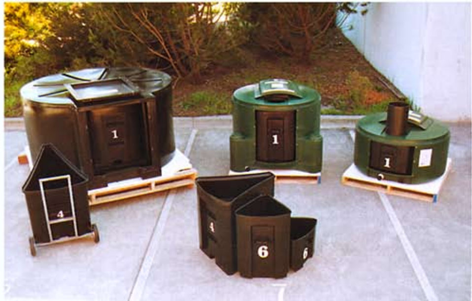
The Rota-Loo comes in a variety of sizes for all applications.

One of the most significant benefits of the Rota-Loo system is its ability to use spare bins. If an installation receives a shock loading and all the bins become full before the first has fully composted, a spare bin can be put in its place and the other removed to finish composting in a safe place.